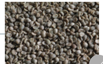
sorted good beans