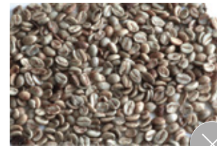
sorted bad beans