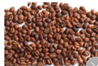
sorted bad beans